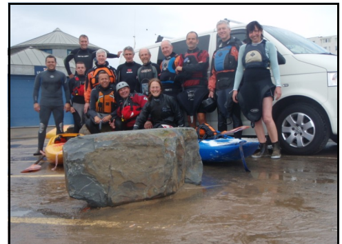
The Hedonists at Summerleaze Beach