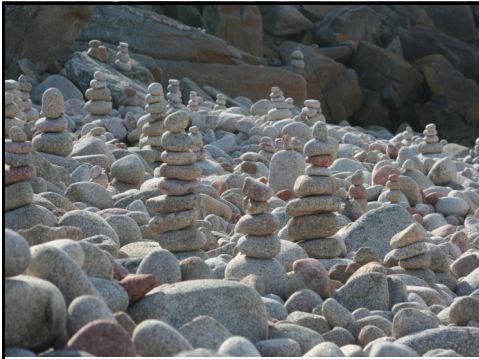
St Agnes, Isles of Scilly