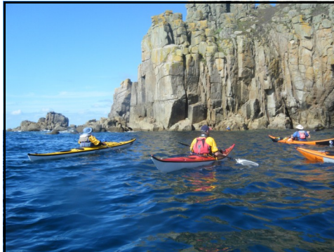
Paddling around Lands End during the Cornish Symposium